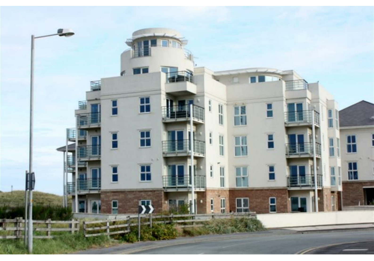
10 Burbo Point 34 Hall Road West, Liverpool, Merseyside L23 8SY £365,000

35 Liverpool Road Great Crosby Liverpool L23 5SD 0151 924 6000 www. berkeleyshaw.com