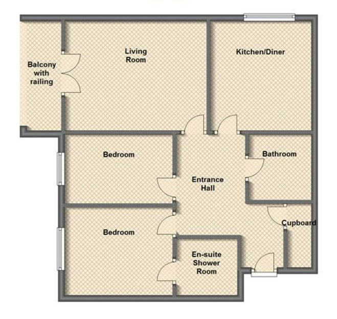
The plan is for illustrative purposes only and should be used as such by any prospective purchaser.