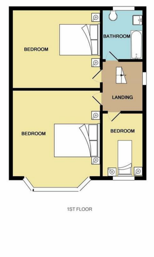
Whilst every attempt has been made to ensure the accuracy of the floor plan contained here, measurement of doors, windows, rooms and any other items are approximate and no responsibility is taken for any error comission, or mis statement. This plan is for illustrative purposes only and should be used as such by any prospective purchaser, the services, systems and appliances shown have not been tested and no guarant as the purpose of the purchaser. The services is their coverability or efficiency can be cifficulty can be contained for efficiency can be contained for the purchaser.