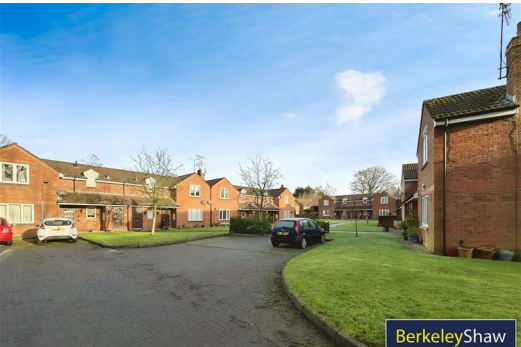
Top Floor Flat, St Georges Court, Maghull