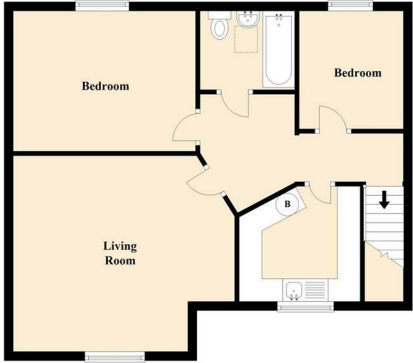
Typical Top Floor Flat

*Measurements of doors, windows, rooms and any other items are approximate and no responsibility is taken for any error, emission, or mis-statement. This plan is for illustrative purposes only and should be used as such by any prospective purchaser. The services, systems and appliances shown have not been tested and no guarantee as to their operability or efficiency can be given.*