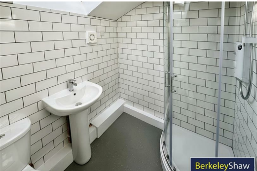
Top Floor Flat, St Georges Court, Maghull

*Measurements of doors, windows, rooms and any other items are approximate and no responsibility is taken for any error, emission, or mis-statement. This plan is for illustrative purposes only and should be used as such by any prospective purchaser. The services, systems and appliances shown have not been tested and no guarantee as to their operability or efficiency can be given.* Plan produced using PlanUp.