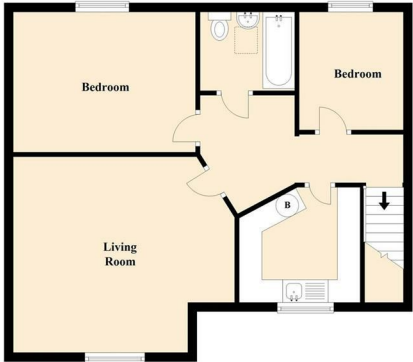
Typical Top Floor Flat

*Measurements of doors, windows, rooms and any other items are approximate and no responsibility is taken for any error, emission, or mis-statement. This plan is for illustrative purposes only and should be used as such by any prospective purchaser. The services, systems and appliances shown have not been tested and no guarantee as to their operability or efficiency can be given.* Plan produced using PlanUp.